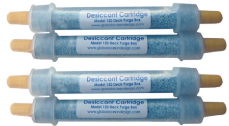
Desiccant cartridges DPB-108