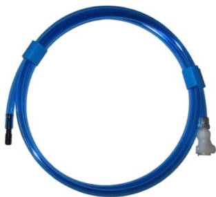
Deck Purge Box Hose (Blue) DPB-110 for EdgeTech releases