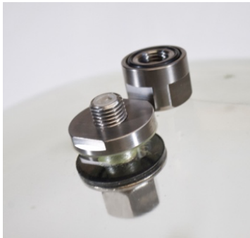
Purge Port 101 in glass sphere.