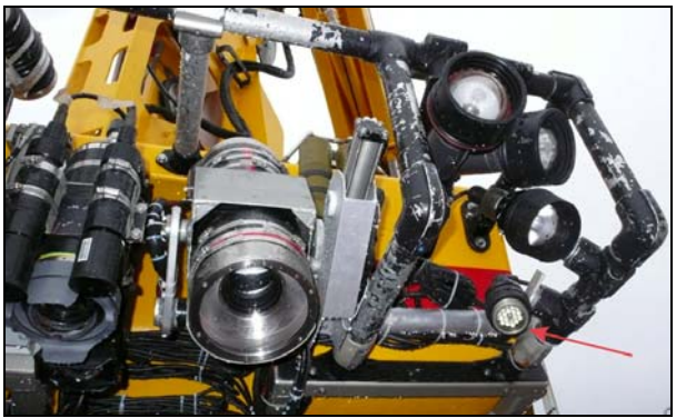
Figure 4. Canadian Scientific Submersible Facility - ROPOS ROV before an evaluation dive with DSPL's 2000-Im LED-MultiSeaLite<sup>®</sup> (red arrow), and other lights.