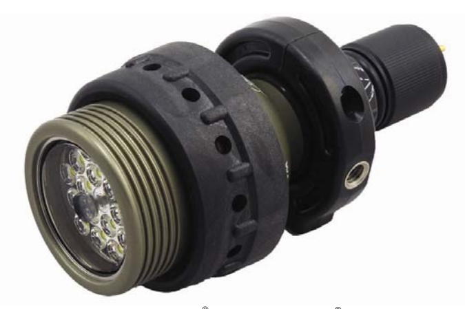
Figure 1. DeepSea Power & Light<sup>®</sup>'s LED-MultiSeaLite<sup>®</sup> is the most advanced solid state undersea light on the market today. The LED light is rated for 6,000m and 2,000 lumen output, and retains the slender form of DSPL's popular MultiSeaLite<sup>®</sup>.

An LED is a diode consisting of several layers of semiconductor material. Light is generated when electrical power is driven through the semiconducting material, where bound electrons capture, then release,