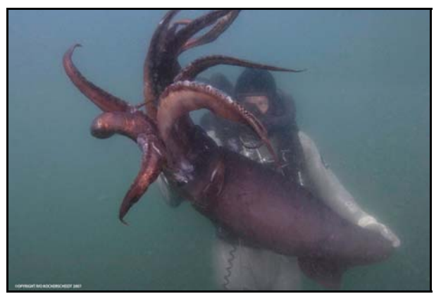
Figure 5. Undersea film maker and explorer, Scott Cassell, holds a live 7-ft Humboldt Squid. Scott has experimented with prototype DSPL LED lights and cameras in his filming.

Scott called the white DSPL LED-SeaLites<sup>®</sup>, "incredibly awesome," and looks to "film a feeding frenzy of Humboldt Squid at night in white light to compare their behavior filmed with the DSPL Night Vision camera. It is suspected they will behave more