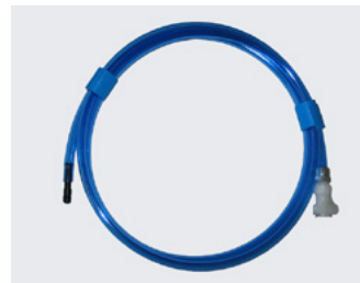
Deck Purge Box Hose (Blue) DPB-110