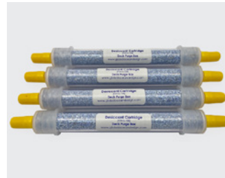
Desiccant Cartridges DPB-108