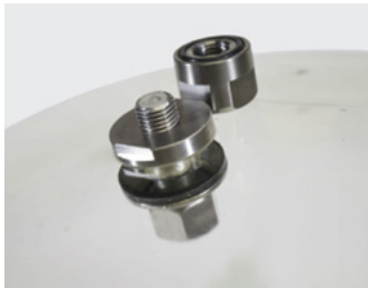
Purge Port for Glass Spheres PP-101